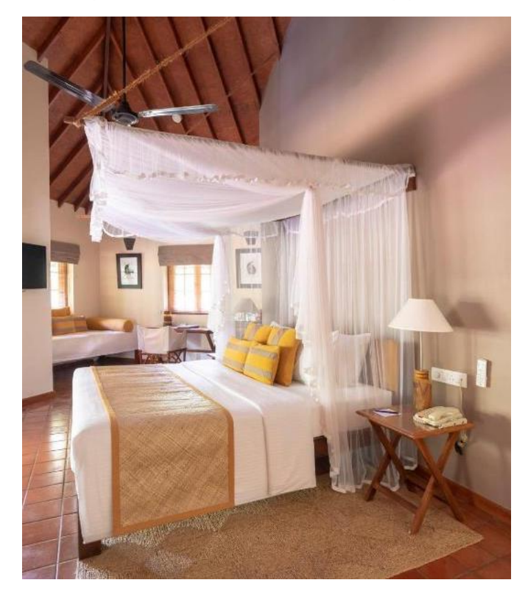
Hideaway: Cinnamon Wild Chamber: Superior Room Meal Type: Half Board

Late evening, enjoy a private candle lit dinner under the lit sky full of stars with a bon fire by your side.