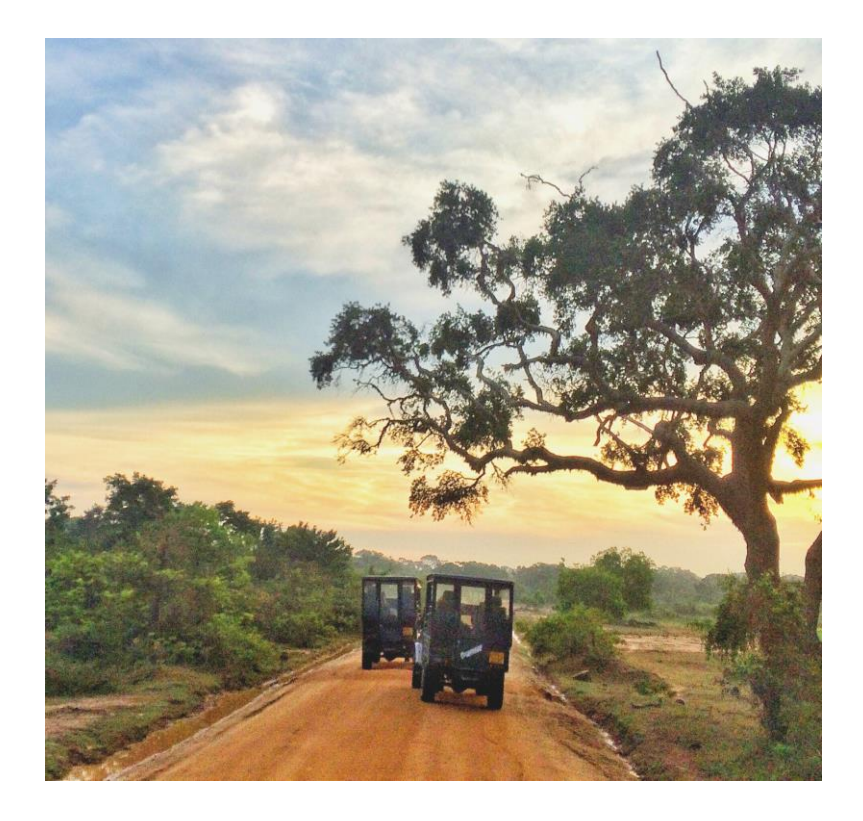
Hideaway: Cinnamon Lodge Chamber: Deluxe Room Meal Type: Half Board

In the evening you will head out to witness the majestic gentle giants in their play ground. Hop on board a private safari jeep with your ranger and head to the Minneriya national park where elephants move at their own pace engaging in their everyday chores. Be guided through the open plains of the Minneirya national park and end off the experience with a hightea in the wilderness.