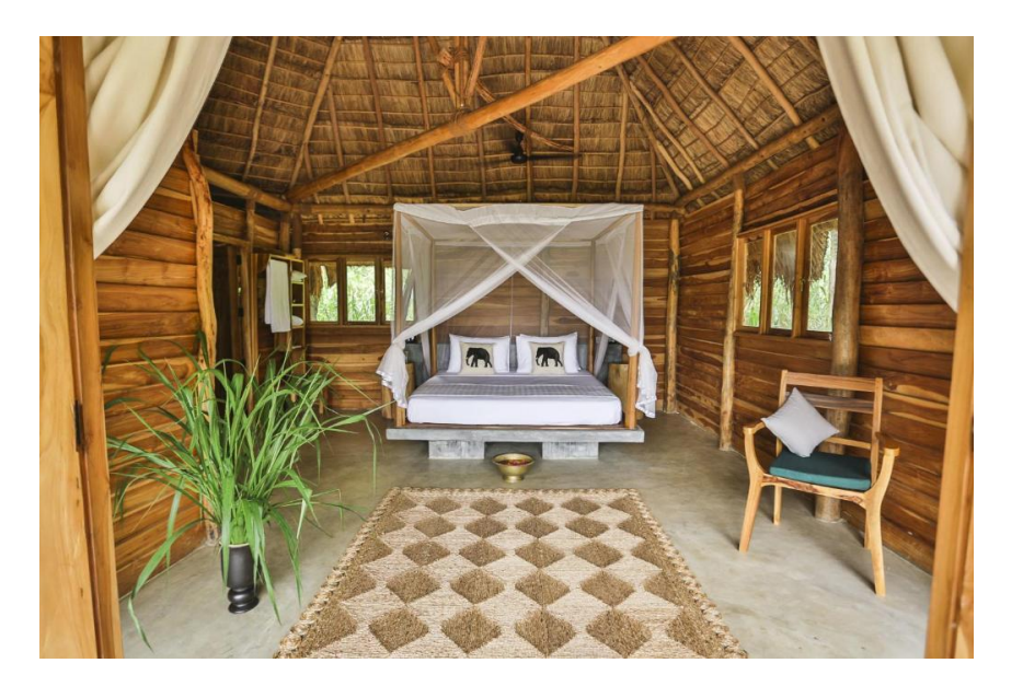
Hideaway: The Gal Oya Lodge Chamber: Bungalow Bedroom Meal Type: Half Board

Check-in to your tent and enjoy the peace and serenity which surrounds you. Enjoy a scrumptious lunch and rest before you head out to explore the wilderness. After lunch you will be taken through the forest on a guided walk by the chief of Vedda to introduce you to the the simple way of life. Be one with nature as you pause a moment to enjoy life every second. Heighten your senses and return back rejuvenated after the walk.