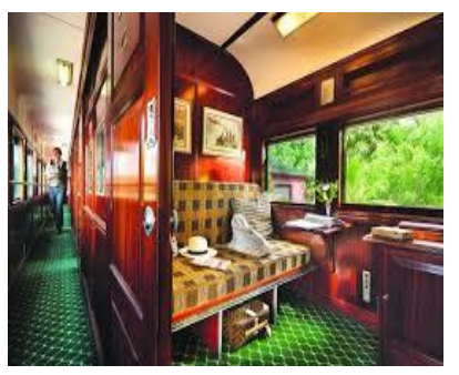
PULLMAN SUITES – Around 7m2 / Double Bed 189x150 / Side-by-Side Twin 189x75 / Single Lower 189x94 / Single Upper 189x60

Tea drawer, air conditioning, fold-out writing desk, luggage shelf, cupboards, safe, en-suite bathroom with toilet, basin and shower