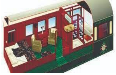
ROYAL SUITES – Around 16m2 / Double Bed 200x189 / Split Twin 200x75

Minibar, air conditioning, writing desk, luggage shelf, cupboards, safe, ensuite bathroom with toilet, basin, bath and shower